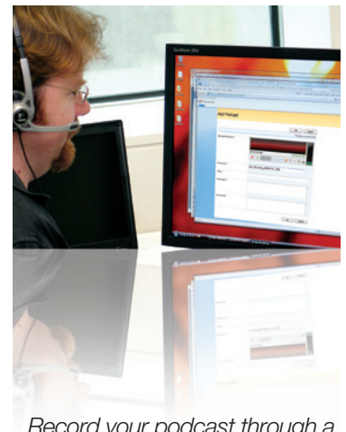
Record your podcast through a browser