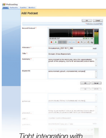
Tight integration with SharePoint 2007

Organizations utilize Podcasting as a new way to improve communication, distribute information and record meetings and events.